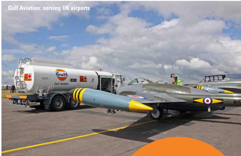
Gulf Aviation: serving UK airports

“Joining forces with Houghton will help further extend and strengthen the brand’s reach across the globe”