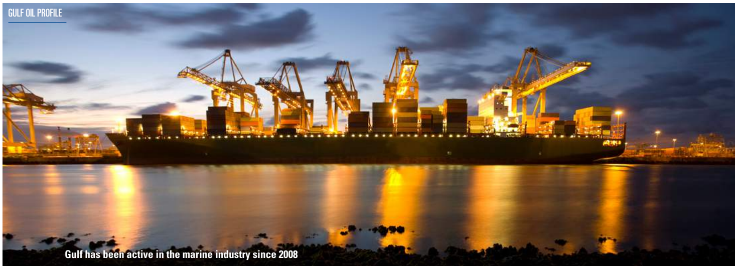
Gulf has been active in the marine industry since 2008